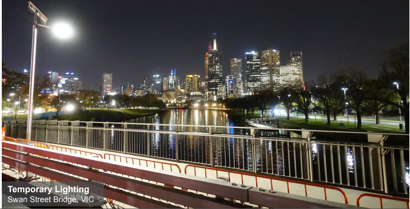
Temporary Lighting Swan Street Bridge, VIC