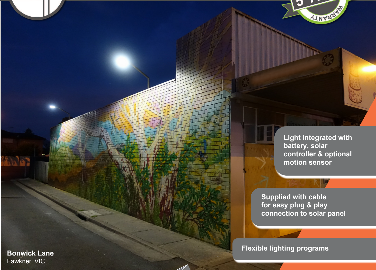
Bonwick Lane Fawkner, VIC

Light integrated with battery, solar controller & optional motion sensor