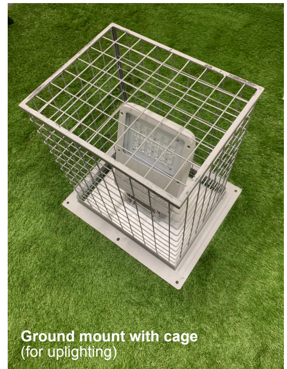
Ground mount with cage (for uplighting)