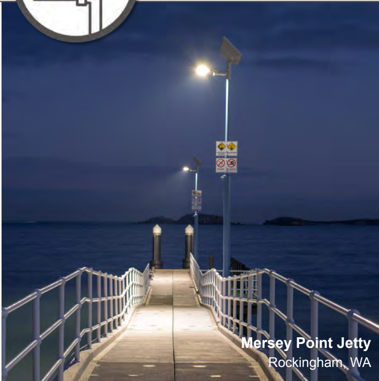
Mersey Point Jetty Rockingham, WA